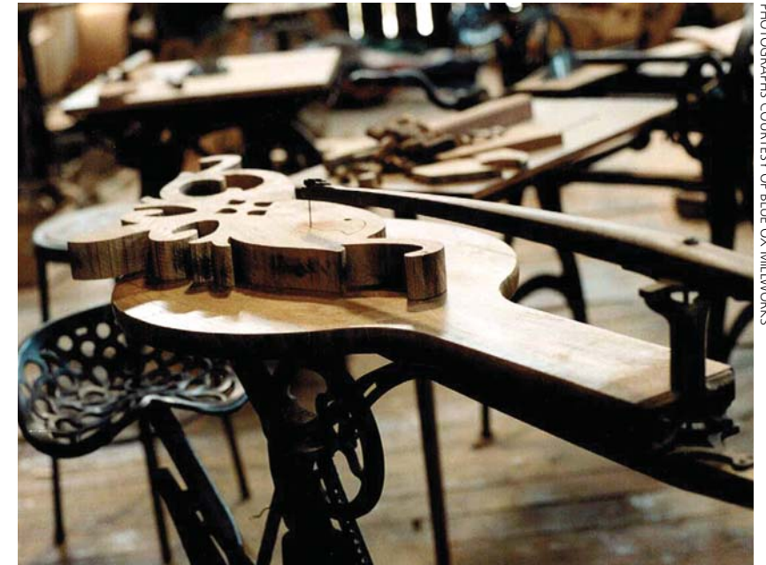
Not relegated to museum relics, Blue Ox uses its vast collection of antique machines to create quality millwork. Here is a gable in progress on the Barnes Velocipede Scroll Saw No. 2. Built in 1889, the saw contains a flat perforated belt and optional boring attachment.