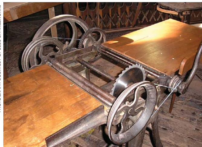
This Barnes circular rip saw, c. 1890, is self-feeding and powered by a hand crank. It is designed to cut through 600 feet of 1-inch-thick pine in an hour, though the feed can be slowed for hardwoods like ash or maple. Its original cost would have been about $40.