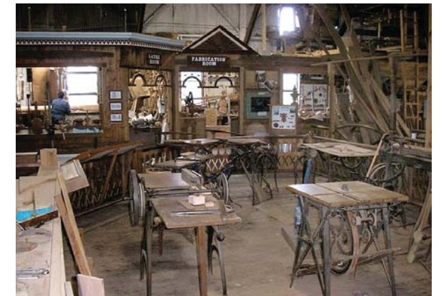
The antique hand-powered tools are right at home inside the Blue Ox workshop.