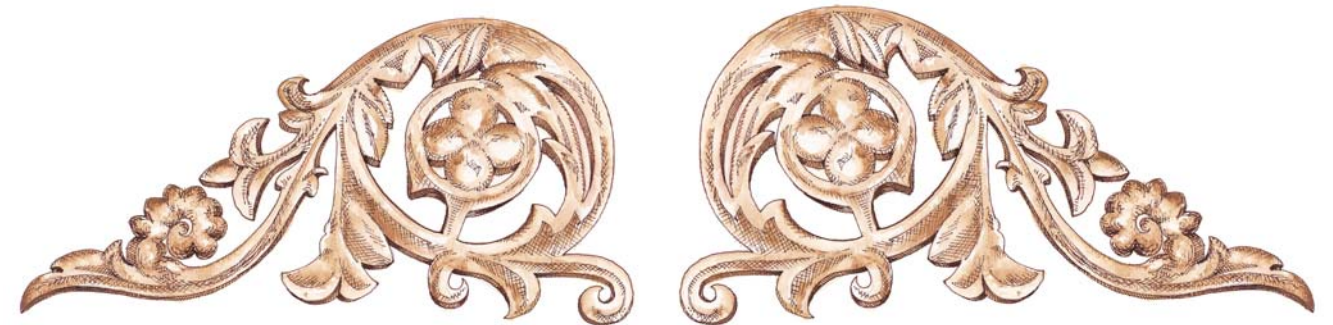
Carved Scrollwork scale: 1/2"=1'-0"